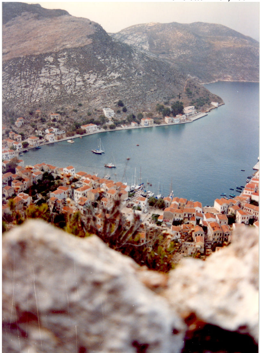
Kastellorizo 1991