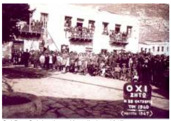
Oxi Day Celebrations, Kastellorizo, 1947. If you can identify yourself or any other Kazzies please let the committee know.