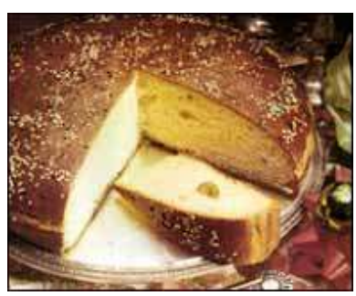
1/2 cup Milk 2/3 cup sugar 1 tsp salt 3/4 cup butter, melted 1/4 cup tepid water 2 tbsp sugar 2 pkts (14g) dried yeast

3 eggs, well beaten 6 - 7 cups plain flour