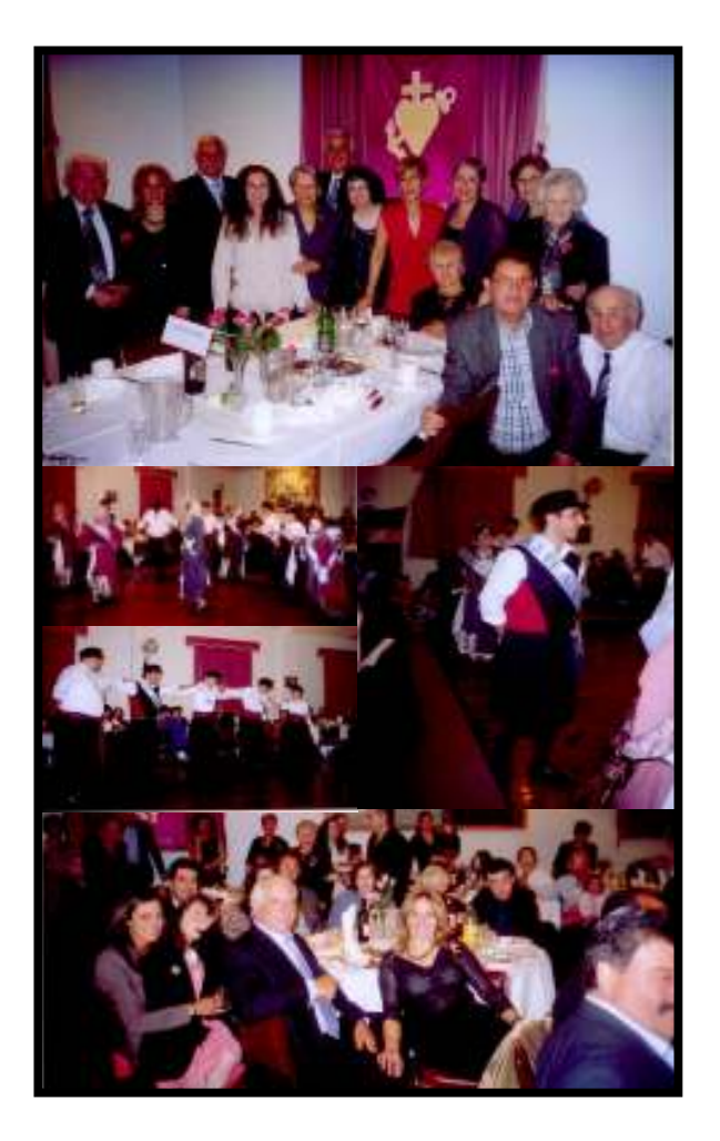
Top and bottom photos: The Kazzie contingency enjoying the evening. Middle photos: Traditional Greek Dance group dancing the many Greek dances during the evening.

On Sunday 6<sup>th</sup> of October at the KOS club in Northcote, the Pan Dodecanese Association held a Glendi. In attendance were people representing each of the 13 islands that make up the Dodecanese group of Islands (see Greek Islands section on page 12). Approximately 250 people attended the function where they enjoyed authentic Greek food, listened to and watched authentic Greek music and dances. The Greek Banquet was supplied by Nikos Tavern of Ringwood. An enjoyable evening was had by all including the two tables of Kastellorizians that attended the function.