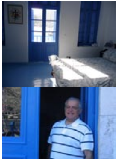
Page 12 © Copyright 2008