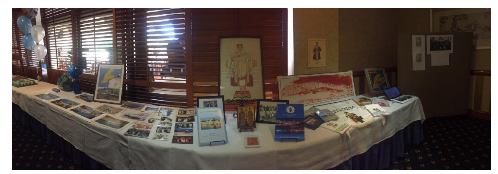
Above: Photographic Display.

In the early days, the goals of the association were simple: to preserve our Kastellorizian traditions, organise functions, stayed connected and help other Kazzies in need. These basic ideals are still the cornerstone of our association. The association commenced with its first meeting held on 2 June 1946. As a result of this inaugural meeting, the members resolved to establish trustees of the Kastellorizian Association of Queensland.