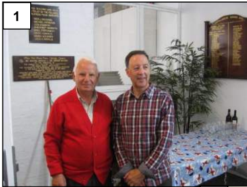
1. Waiting in anticipation for guests to arrive