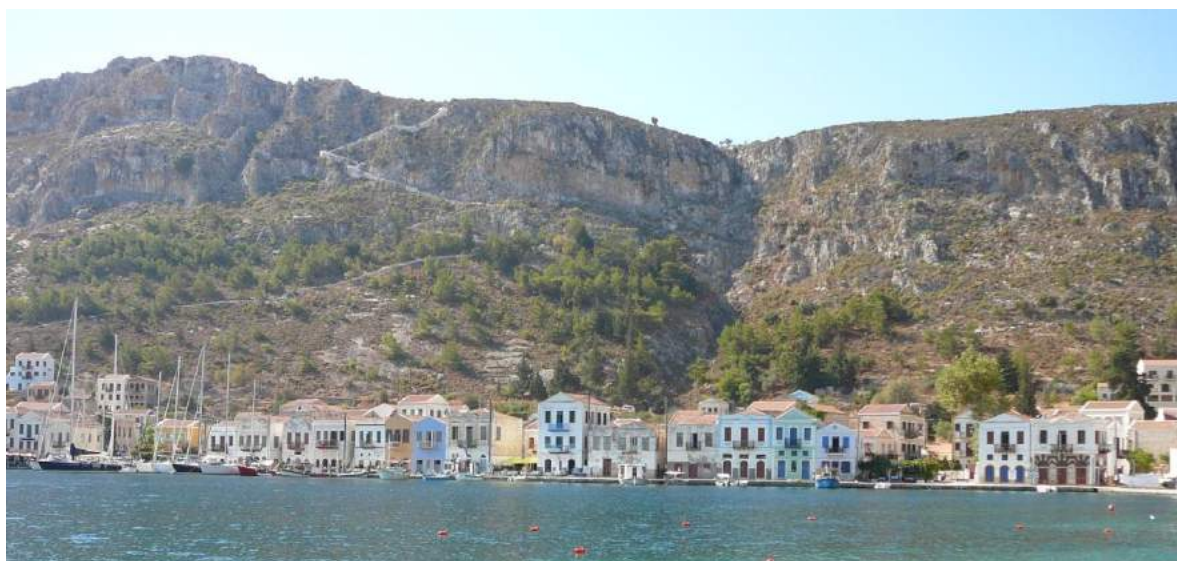
Above: Kastellorizo. Calendar Competition 2010

Articles will not be considered unless the name and contact details of the author is supplied to the editor.