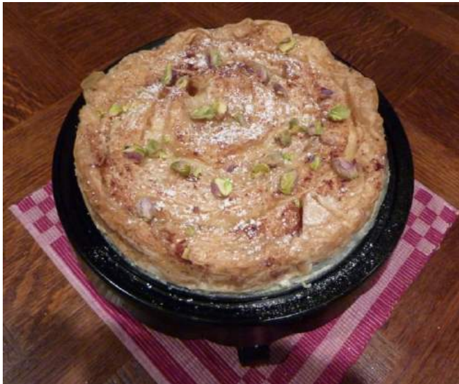
Above: Home made Soufra

http://www.marthastewart.com/332911/ruffled-milk-pie