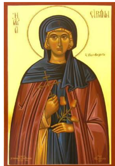
Above: St Irene, Patron Saint of Peace, May 5