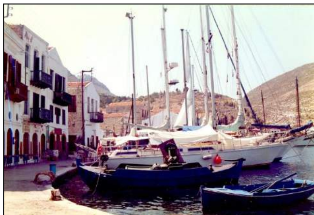
Above: Sail boats in Kastellorizo harbour, 1988