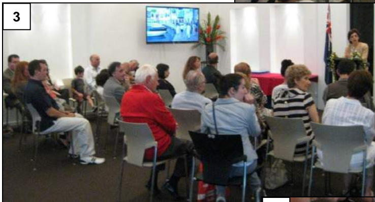
3. Members listen attentively to the progress of the Kastellorizian Association of Victoria