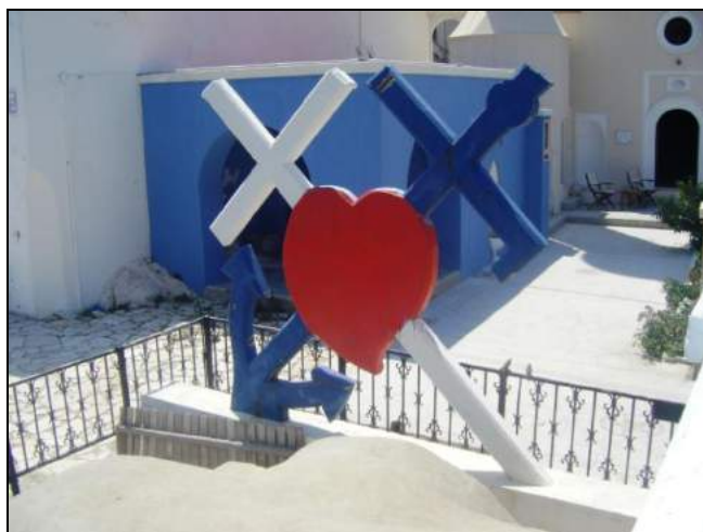
Above: The Faith, Hope and Charity statue, the symbol of the Kastellorizian spirit, stands proudly on the island of Kastellorizo.