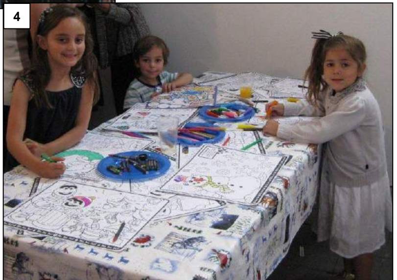
4. The children enjoy a range of activities