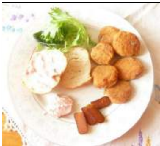
Above: A lenten meal of chickpea patties, avgotarako, bread and taramosalata and lettuce greens

It is hard to believe just how fast time moves and that Easter is around the corner. However the 40 days prior to Easter Sunday is Lent. During this time many Orthodox Christians with devout religious or cultural beliefs follow a strict fast which oscillates between a vegetarian and vegan diet. Many of these recipes use pulses, lentils and grains which require many hours of preparation. However, these days we are time poor compared to our parents and grandparents generation and this often ends up as an excuse not to partake in Lent. Therefore for this edition of Kazzie Kerasma I have supplied two Lenten recipes which have minimal preparation time, are nutritious and can also be enjoyed throughout the year.