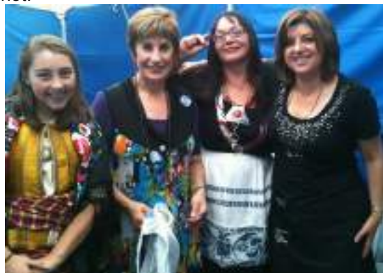
Left: Katoumari Day at the Antipodes festival

PS And for the person who asked, if "Katoumaria" means "Get Down Maria" - "No, it definitely does not!"