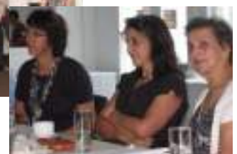
Right: Three very attentive Anastasiou (Penglis) family members