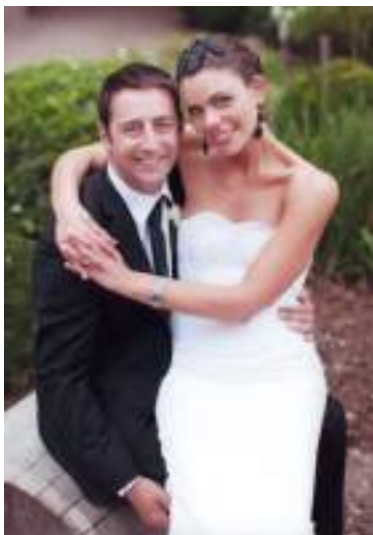
The beautiful brides with their husbands